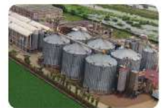
Matco Rice Plant Gujranwala, Punjab