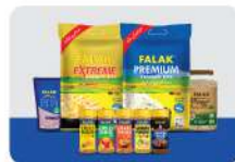
Matco Rice & Food Products Facilities Karachi, Sindh