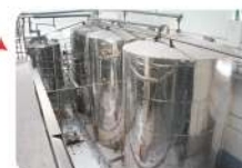
Matco Rice Glucose Plants Karachi, Sindh