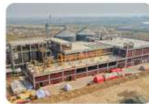
Matco Corn Division Faisalabad, Punjab